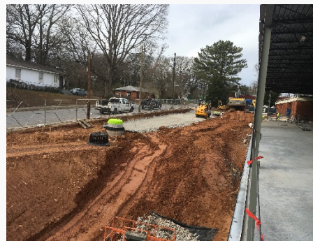
Grading at Bus Loop