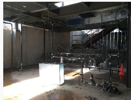
Plumbing Install at Restrooms