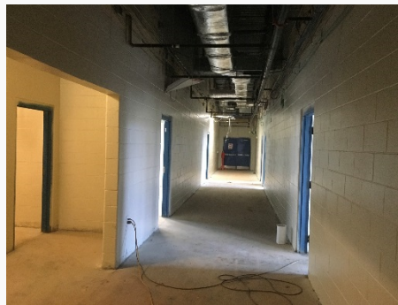
Prime Paint at Renovation