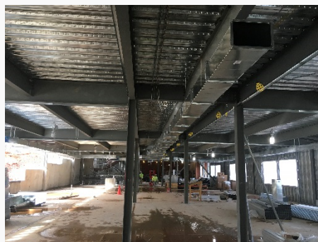
Installation of Duct at Lower Level