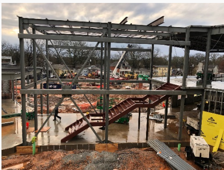
Installation of Monumental Stair