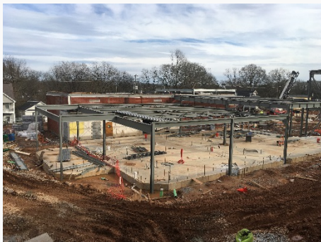
Structural Steel at Kitchen